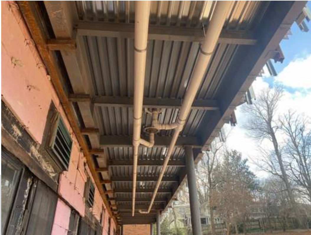
Roof drain piping at cafeteria addition