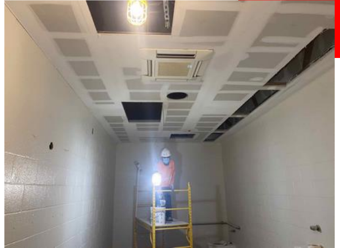
Restroom hard ceiling install