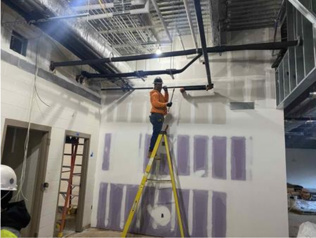
Sprinkler pipe installation