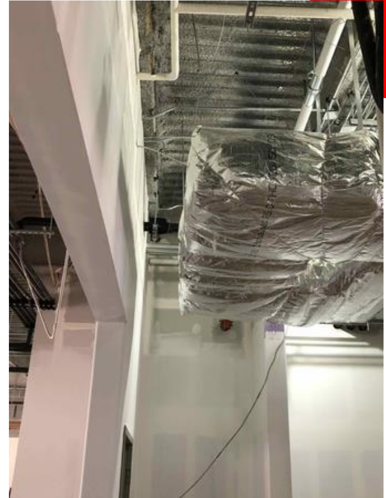
Kitchen ductwork installation