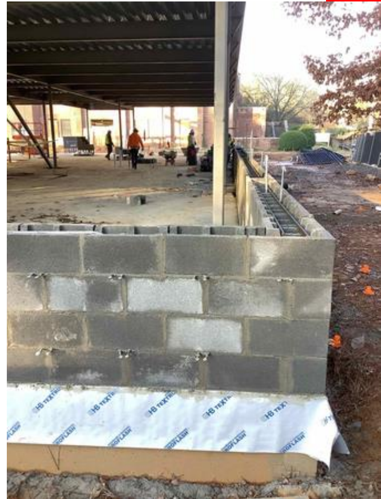
CMU installation at addition