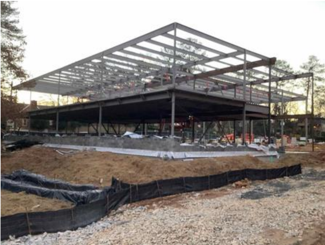
New addition structural steel