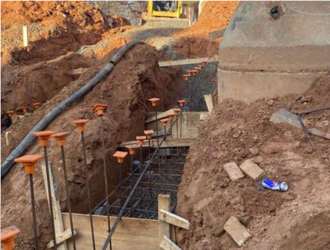
Cafeteria courtyard stair installation